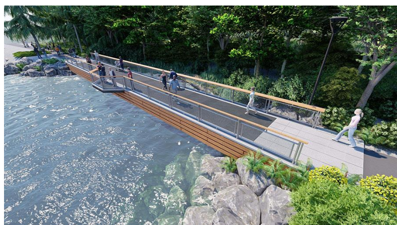
New trestle bridge at Gene Coulon Memorial Beach Park